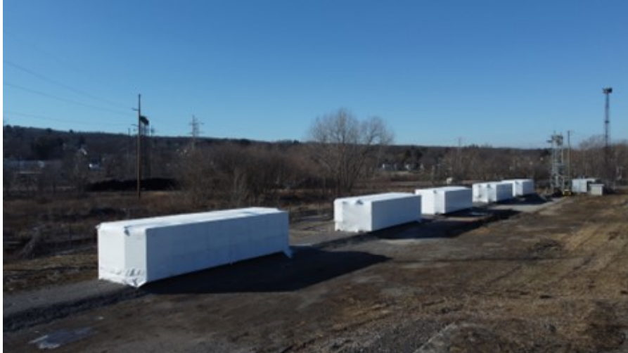
Sharon, Pennsylvania facility expansion