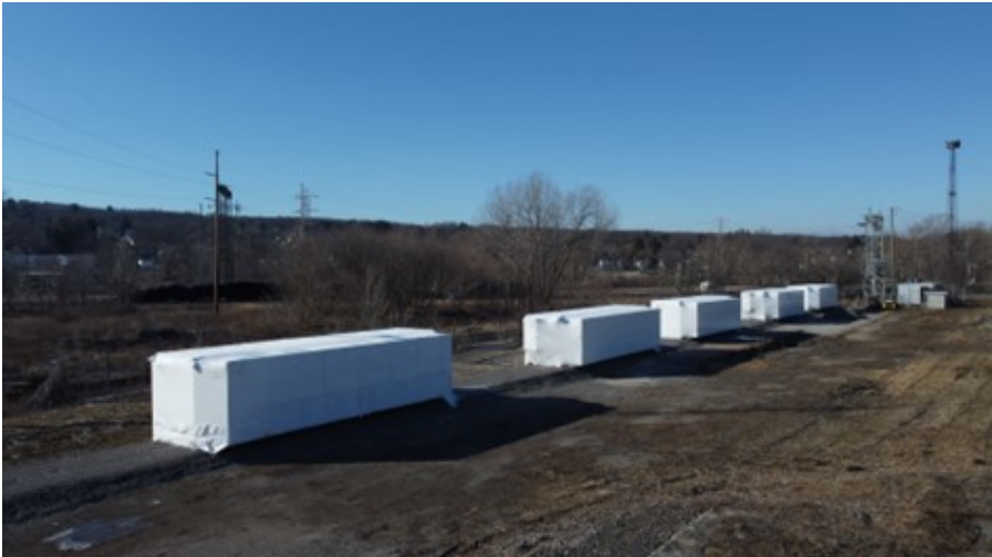
Sharon, Pennsylvania facility expansion