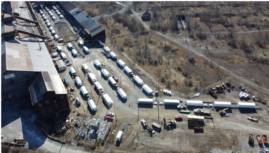
Aerial view of Midland, Pennsylvania

2 Based on the continued development of the Midland and Sharon facilities to their maximum capacity.