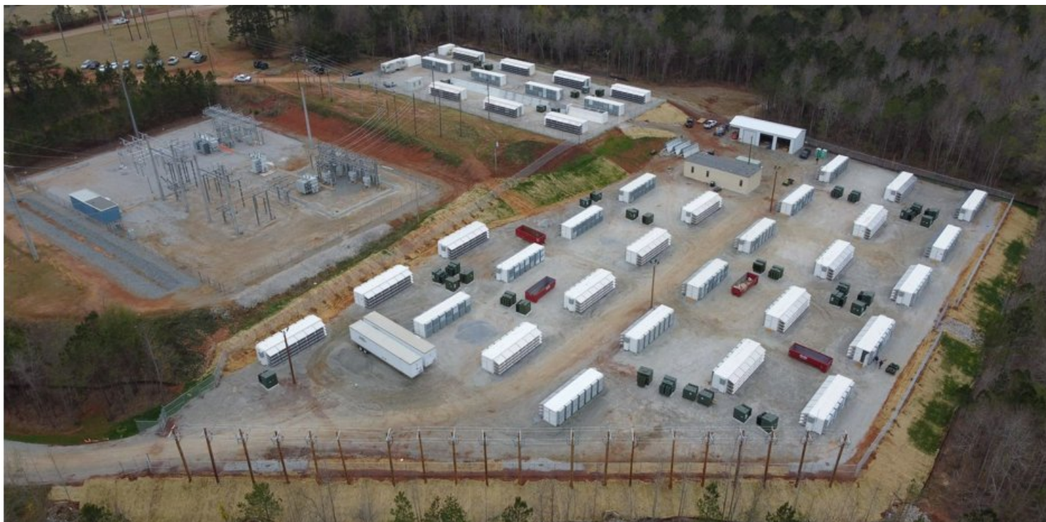
Aerial view of Sandersville, Georgia facility

Australian facility: Site commissioning ongoing, with operational ramp up expected to occur steadily throughout Q2, with approximately 0.1 Exahash online by the end of April, with the facility expected to be fully operational with approximately 0.4 EH online by June 2022.