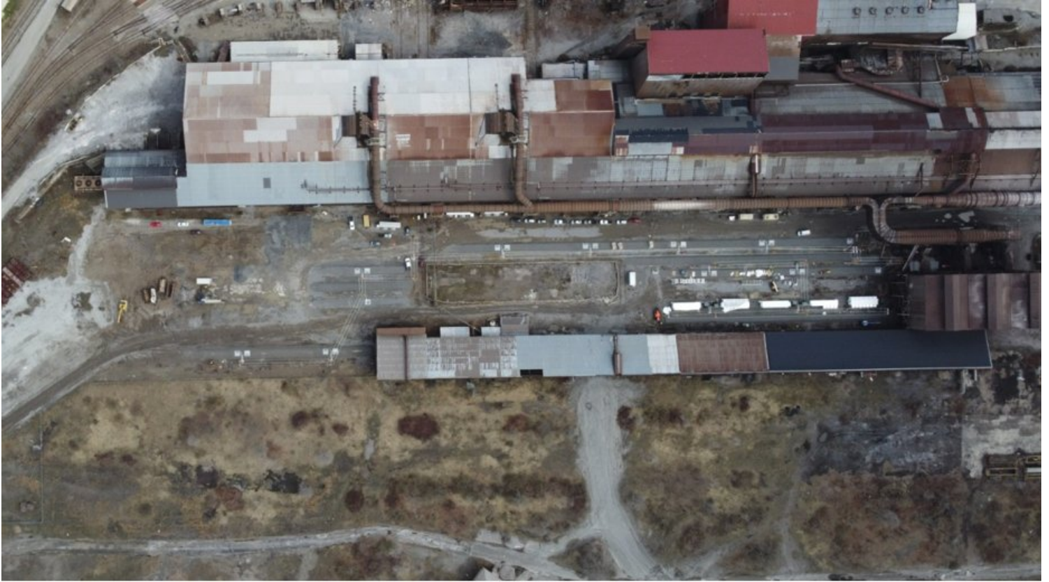
Aerial view of Midland, Pennsylvania facility development

Sandersville, Georgia facility: 38 Modular Data Centers (MDCs) now online, site now fully operational at approximately 80 megawatts online. Stage 3 expansion approved to 230 megawatts (capable of accommodating up to 7.5 Exahash) with first stage of development for 150 megawatt expansion due to commence late Q2, 2022.