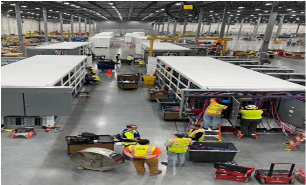
USA Modular Data Center (MDC) fabrication facility