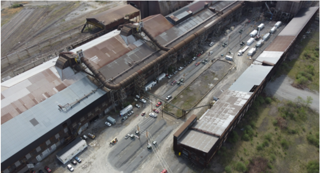
Aerial view of Midland, Pennsylvania facility development (April 2022)