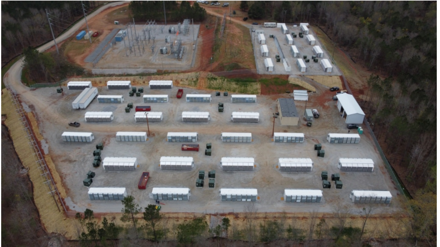
Aerial views of Sandersville, Georgia facility – 80-megawatts / 38 Modular Data Centers (April 2022)