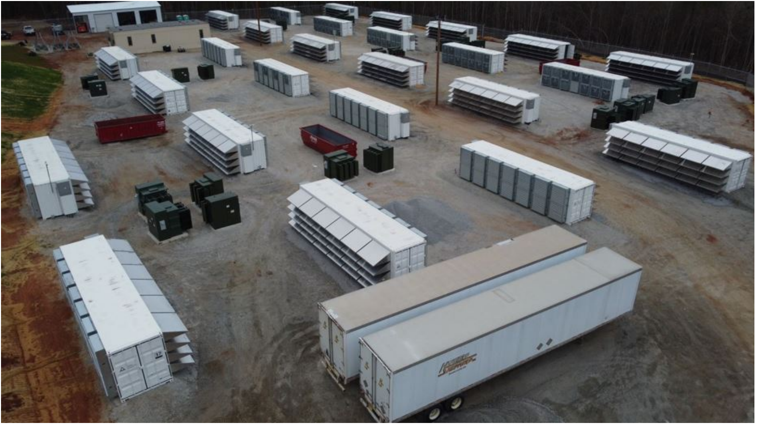
Aerial views of Sandersville, Georgia facility expansion