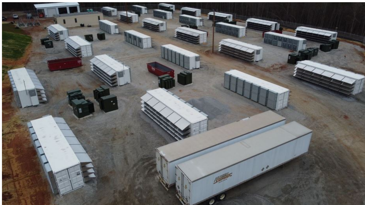
Aerial views of Sandersville, Georgia facility expansion